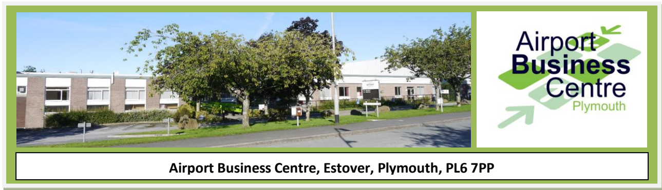
Airport Business Centre, Estover, Plymouth, PL6 7PP